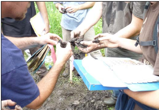
Determining hydric soil indicators starts with basics in texture and color.